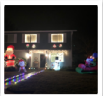
Indianhead- 203 Lavoie Ave.