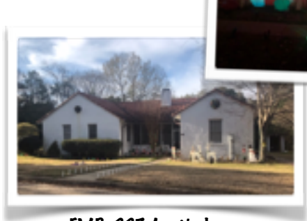
EMP- 227 Austin Loop