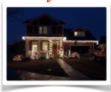
Custer/Upatoi- 7652 Pintail