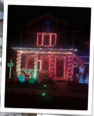
McGraw- 8222 Chickasaw